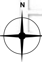
GROUND FLOOR h = 2.53 m